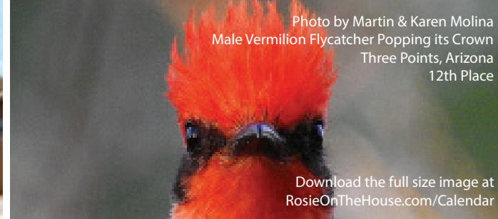
Male Vermilion Flycatcher Popping its Crown Three Points, Arizona 12th Place

THE "ROSIE" WAY TO MANAGE YOUR HOME RosieOnTheHouse.com/App